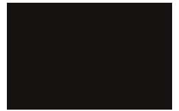
Extra Dark Bronze